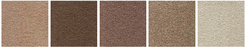
TUFTEX TWIST 30 TUFTEX TWIST 39 TUFTEX TWIST 34 TUFTEX TWIST 32 TUFTEX TWIST 92