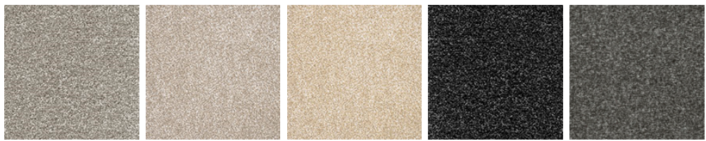
TUFTEX TWIST 07 TUFTEX TWIST 45 TUFTEX TWIST 53 TUFTEX TWIST 59 TUFTEX TWIST 96