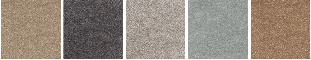
MEMORIES 36 MEMORIES 43 MEMORIES 45 MEMORIES 75 MEMORIES 84