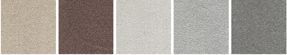
SUSPENSE 39 SUSPENSE 40 SUSPENSE 57 SUSPENSE 58 SUSPENSE 59