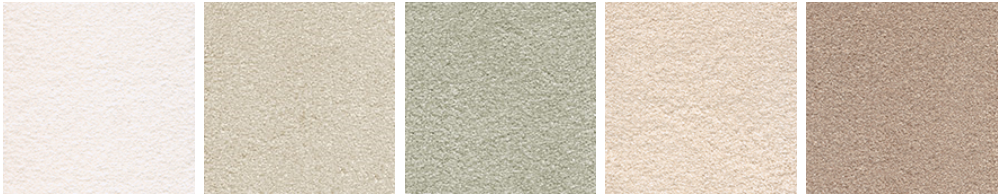
SUSPENSE 03 SUSPENSE 04 SUSPENSE 20 SUSPENSE 30 SUSPENSE 36